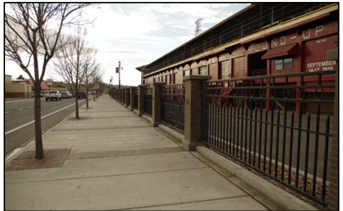
An attractive new fence replaced the chain link and trees and a new sidewalk design added to the appeal of the new stadium design.