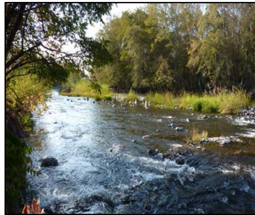
The new park improves access to the Umatilla River, which runs through downtown Pendleton.