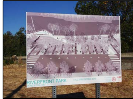
Initial design for the park was presented to the public in public workshops and at the park site.