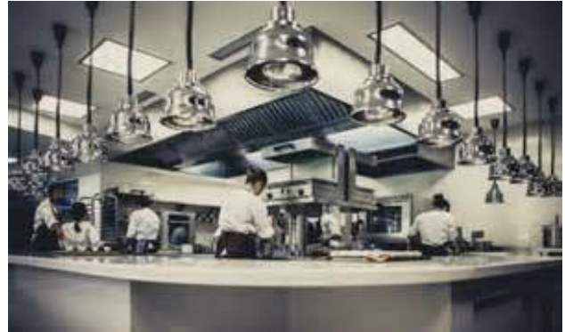
Example: New Kitchen Design