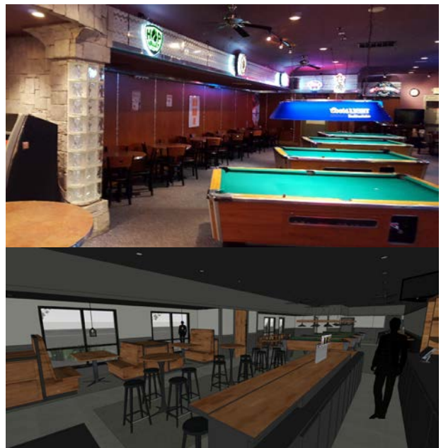
Example: Ickabod's Before & Design