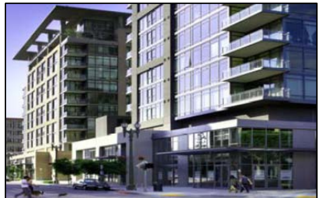
Example: Mixed Use Rental