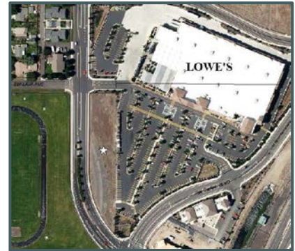
2-Site is remnant property across from a school and retail development