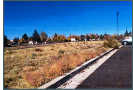
1-Existing site condition